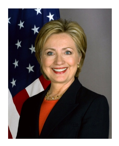
Is Hillary Clinton someone others will follow?

As Election Day approaches, we often find ourselves asking the question "Hillary or Donald – which candidate will really make the best leader?"